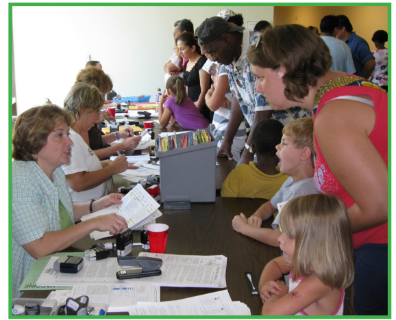
Many children are served during Back-to-School events.