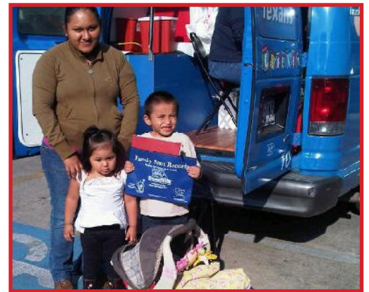
Children who recently received immunizations pose with their mother and the Care Van.

Thank you for your support! If you would like more information about the Care Van Program in your area, or to make a donation to help support our mission, please visit us at carevan.org . ❤️