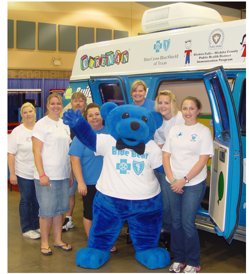
Blue Bear makes a guest appearance with volunteers in Wichita Falls.

I n Wichita Falls, employees of the Blue Cross and Blue Shield of Texas (BCBSTX) Full Service Unit and staff from the Wichita Falls-Wichita County Public Health District work together with the Care Van to provide immunizations and promote health and wellness for children and adults.