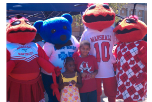
Young visitors to the Fire Ant Festival are surrounded by a group of larger-than-life characters.

T he Care Van recently made a trip to Marshall for the annual Fire Ant Festival. Many people may not know what a Fire Ant Festival is, but for the Care Van program, it was a chance to bring the community together on a beautiful sunny fall day.